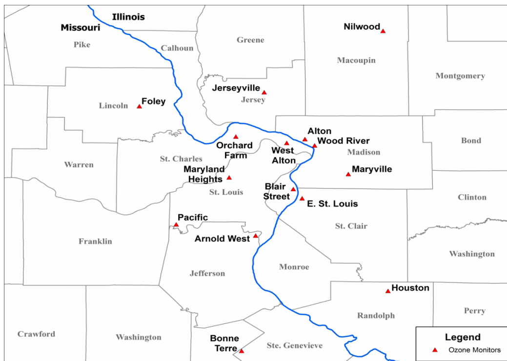
Figure 3.1 Ozone Monitors in the St. Louis Area

Currently there are 11 ozone monitors located in the nonattainment counties in the St. Louis region; 6 are located in Missouri and 5 are in Illinois. Missouri and Illinois also operate ozone monitors at locations upwind and downwind of the metropolitan area. Figure 3.1 shows the locations of these monitors.