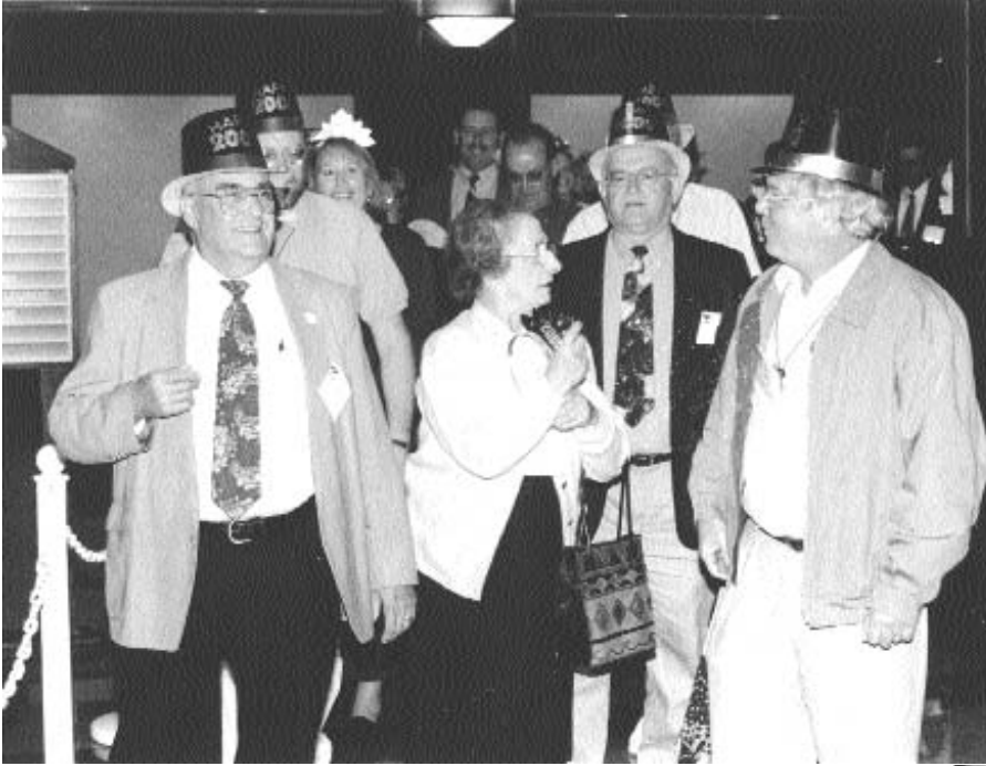
Above: A moment for serious discussion during the festivities.