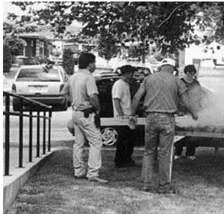
Burgers and brats starred at the CIPWO's summer meeting.

Approximately 50 members and guests attended the summer meeting of the Central Illinois Professional Wastewater Operators group held July 28 at Marshall, in Clark County.