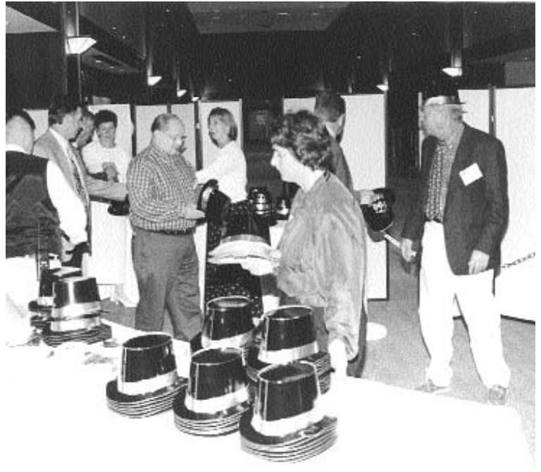
Above: Decisions, decisions. The toppers and tiaras were all alike and all the same size, but all the guests looked good in them.