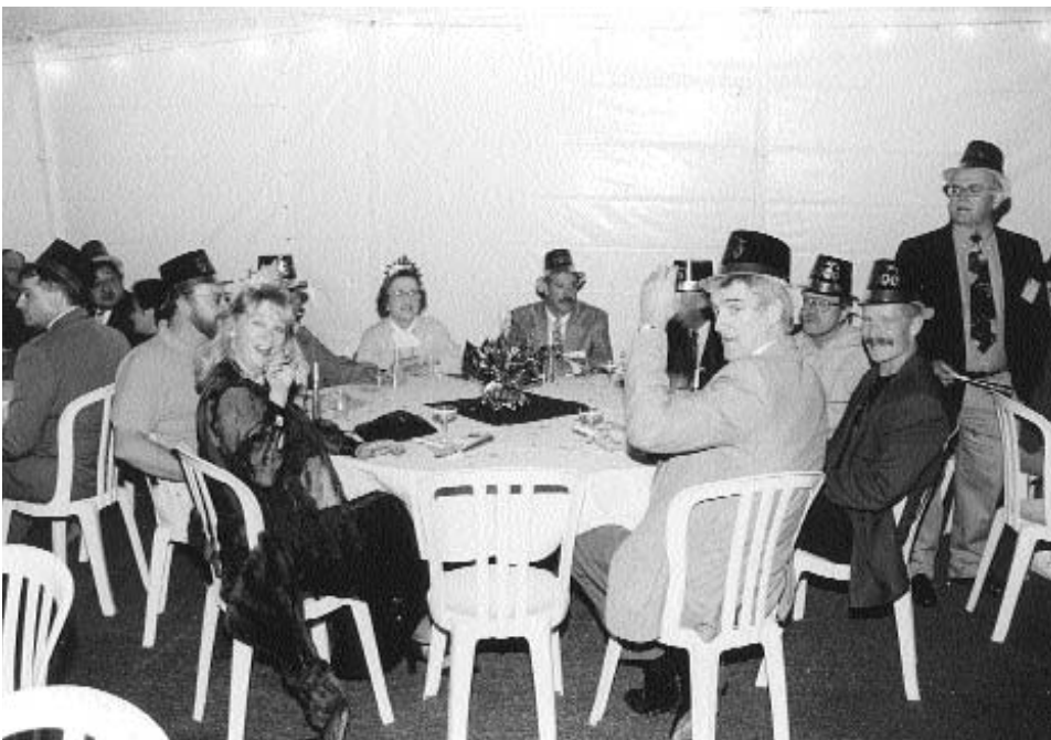
Left: "Regal" was the word for the guests at the IPWSOA gala.