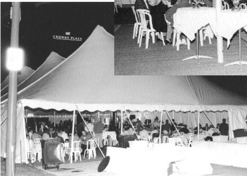
A great conference, a great dinner and good company created an outstanding evening winding up the last annual conference of the 20th century.