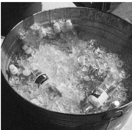
Elgin now offers portable potables by bottling the water it produces.

During the tour, the visitors were provided with samples of the city's water in its bottled version. Like many other plants, Elgin has begun producing bottles of the water it distributes. Because of the stringent monitoring and testing requirements for public water supply facilities, many professionals believe tap water is a safer choice for those who like the convenience of bottled water.