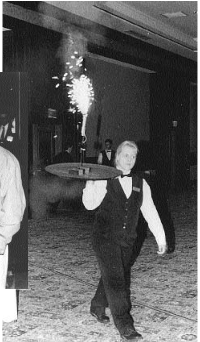
Right: No fat and no cholesterol, but lots of spectacle as waiters carried giant "sparklers" in a dinner production.