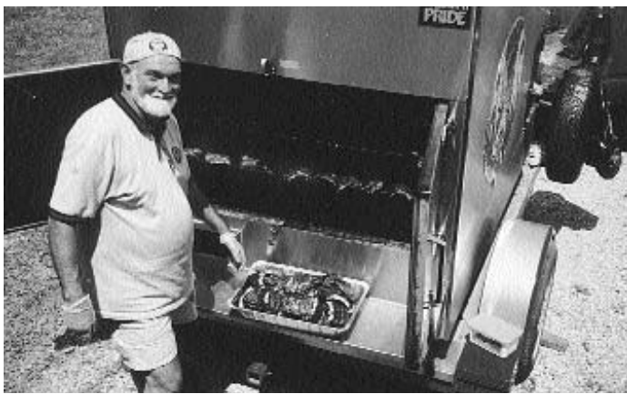
Barbecue starred on the lunchtime menu.