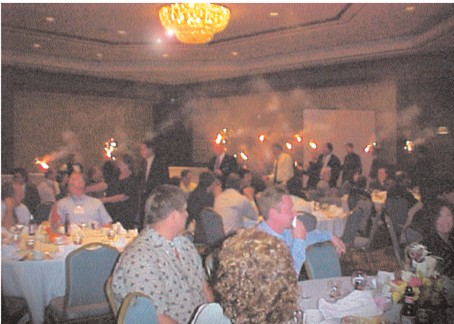
Dinner kicked off with a choreographed fireworks display.

Nominees are interviewed by a selection committee during a fly-around of the state. Nominees are