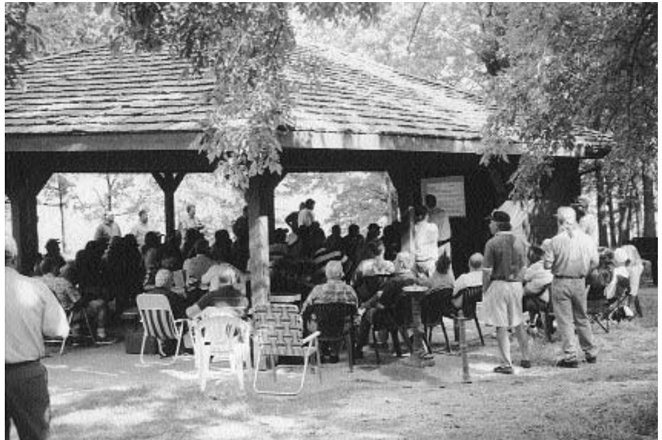
Operators listen to a speaker at a recreation area shelter.

The Great Boars of Fire catered a dinner of barbecued ribs and chicken, and door prizes were awarded. Operators then toured a MIOX liquid chlorine generation plant and the Rend Lake Intercities water plant.